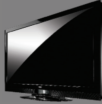
VIZIO HIGH DEFINITION TVs with VIZIO INTERNET APPS